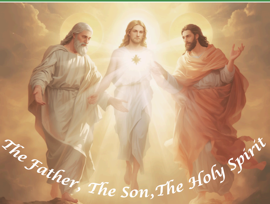
The Father, The Son, The Holy Spirit